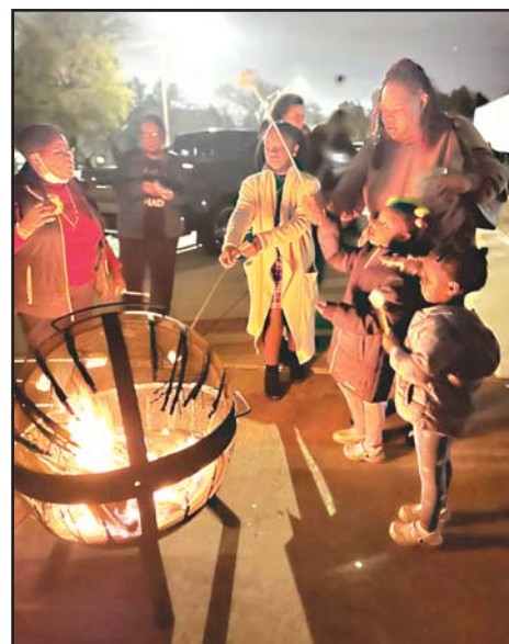
Children roasting S'mores