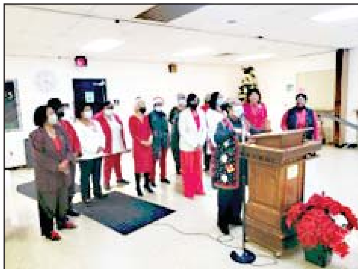
Bouquet attendees welcome caterers "Seasoned From Above"

Your St. John Women's Missionary Union is SO thankful for you! Our St. John Family, Friends and Supporters have TRULY blessed us this past year. We have had an opportunity to be a blessing to SO many through your prayer and financial assistance.