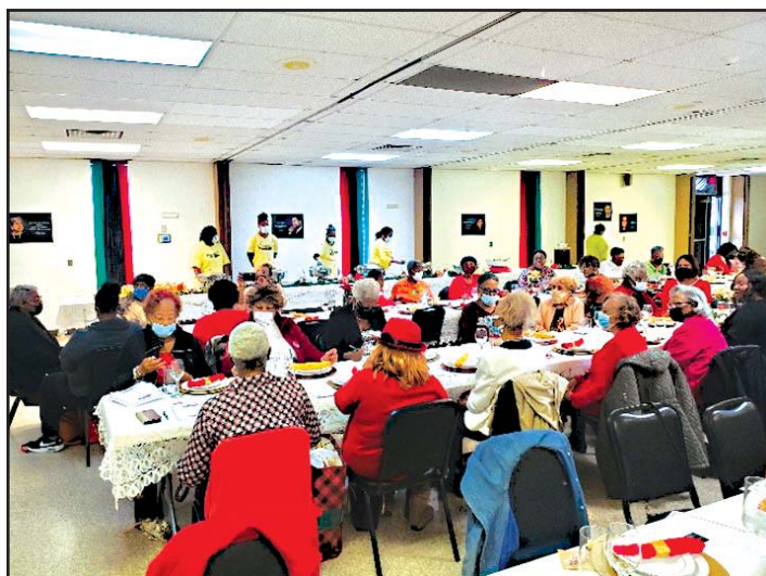
Circle OHJ Leads Devotion at WMU Bouquet