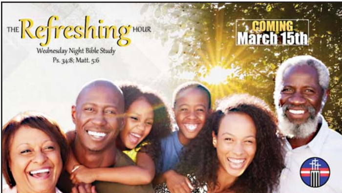
LOVE IN ACTION – THAT IS WHAT WE DO!!