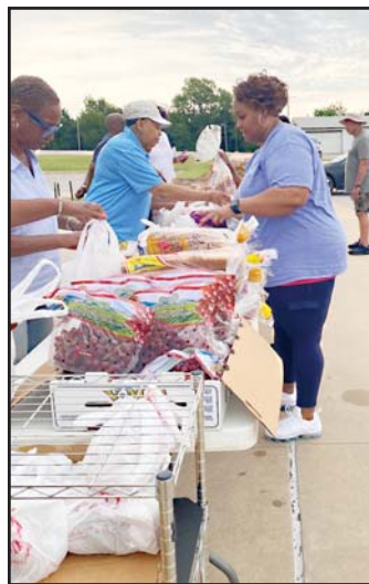
Food Pantry Giving