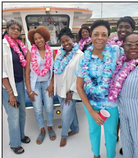
Ladies on Deck

Keeping Seasoned Saints active and engaged in all St. John ministries is one of the tenets of our ministry. Please stay hydrated during this extremely hot and humid summer season. We look forward to passing on vital information at our Healthy Aging Conference in September.