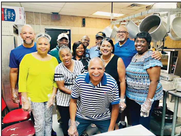
Hospitality; and Safety & Security & July PF Serving the Refreshing Hour